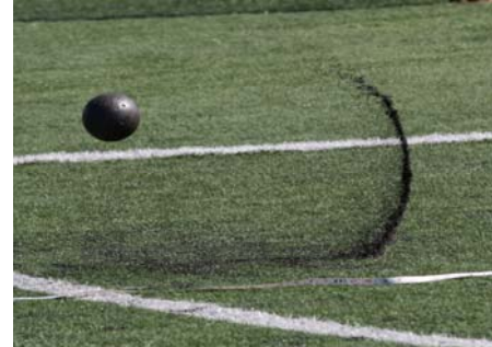
Crumb rubber turf flying at Gunn High School, Palo Alto, California, May 25, 2017. Gunn High School’s field is regularly used by student athletes from San Mateo County. Used with permission.

Crumb Rubber Infill is a form of TDP and refers to the small “pellets” that fill the spaces between the “grass blades” in artificial turf fields. These pellets can be “enhanced by the addition of metals, chemicals and other materials,” 5 and coated with colorants, sealers, or anti-microbial substances if desired. This form of TDP is the focus of this report and of the ongoing EPA research.