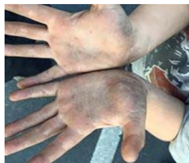
PlayItSafeAromas.org (CA). The black residue on a child's hands after playing on a TDP playground. https://benitolink.com/rubber-tire-mulch-removal-playgrounds-school-board-agenda .

In the absence of conclusive scientific research, a number of investigations identifying the presence of lead and other toxins in TDP have led to child safety concerns about such products. 15 After playing on crumb rubber and other TDP surfaces, some children have left with blackened hands and faces. 16 TDP has also been suspected of causing other health issues, including cancer. 17 As a result of these and other concerns, school districts and other agencies around the country have begun limiting or banning the use of crumb rubber and other TDP in fields and playgrounds. 18